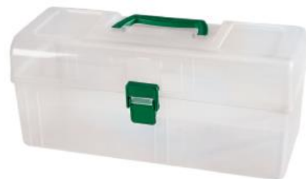
ESF9-0729 Transparent plastic case 32,5x12x10,5h cm