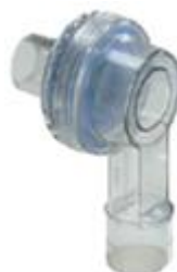
072/PVW.01 60 cmH2O For reanimation bag adult, disposable