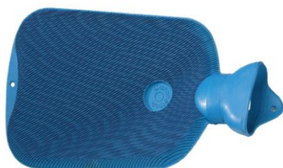
ESF15-9050 Hot water bag 2000 ml