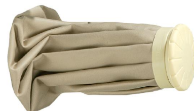
ESF15-9051 Ice bag cm25