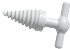
PRA067 Mouth opener