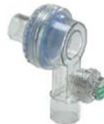
072/PVWC.01 40 cmH2O For reanimation bag child, disposable