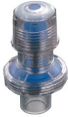
072.P.10 PEEP VALVE 2-10 cmH 2 O, ORANGE , 30M