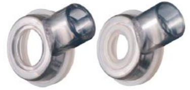
072.P.30 PEEP VALVE DIVERTER Autoclavable. 30M/22F