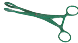
PIN201 Tongue puller