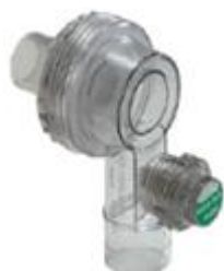
072/PVWC 40 cmH2O For reanimation bag child, autoclavable