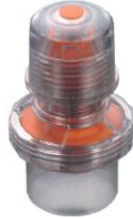
072.P.20 PEEP VALVE 5-20 cmH 2 O, BLUE, 30M