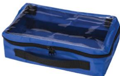
ESF9-0727 With zip, handle and transparent cover 32x12x11h cm