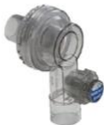
072/PVW 60 cmH2O For reanimation bag adult, autoclavable